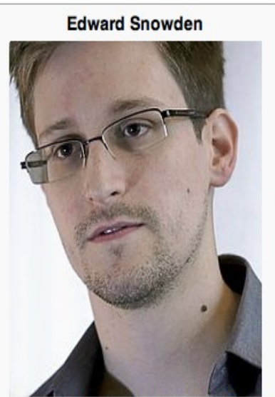
Screen capture from the interview with Glenn Greenwald and Laura Poitras on June 6, 2013