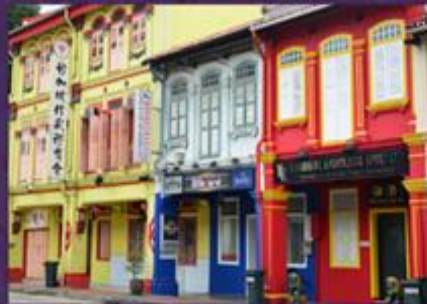
NEIL ROAD (PRESENT)

The roads of Tanjong Pagar: tracing the first roads to the latest expressways – interactive storymap created by 2017 champion. The challenge encourages evidence-based research and use of geospatial data.